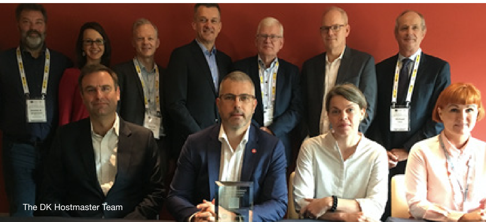
The DK Hostmaster Team

The Alliance for Safe Online Pharmacies (ASOP Global) together with ASOP EU presented its annual Internet Pharmacy Safety E-Commerce Leadership Award to .DK Hostmaster at the 2018 ICANN63 on 22 October. The domain name administrator for Denmark, DK Hostmaster, was selected for the award based on their commitment to ensuring citizen safety by maintaining transparent WHOIS data, proactively enforcing identity accuracy policies to increase consumer trust and safety online.